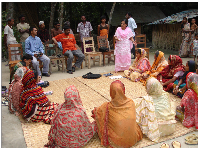
Trainer and micro-loan group gather to report success and learn new skills.

The women belong to one of 178 micro-loan clubs – groups of 10 -15 women with one trainer – whose desire is to take a small amount of money and make it grow. To support the women in their venture, the trainer of each club educates them about nutrition and health, sanitation, good business practices, legal rights, and empowerment.