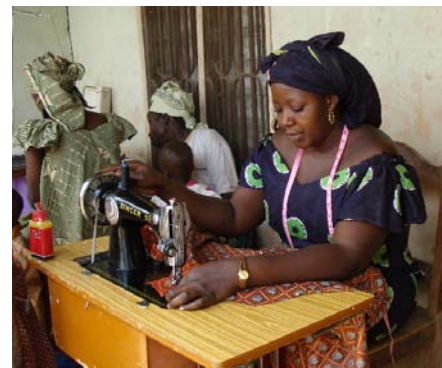
Nigerian woman sews on machine provided by SowHope.