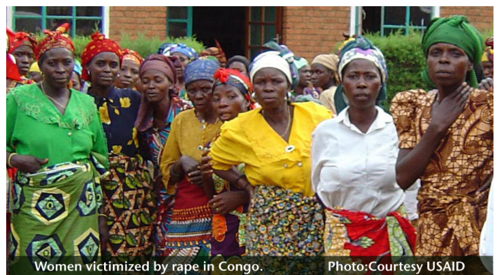
Women victimized by rape in Congo.