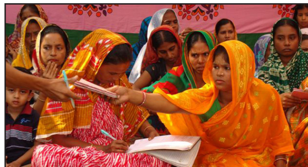
Bangladesh Microloan club weekly meeting - making payments.

T his past October, SowHope completed a micro-loan project in Bangladesh. 3,130 women received loans through this project. Some women used the funds to buy chickens, goats or cows to support their small farm, selling eggs, milk and cheese. Others began businesses such as rickshaw rentals, tailoring, candle-making, or knitting and sold the product or service. Combined with the financial opportunity were weekly trainings that supported the women as they learned about nutrition, small business practices, and social and legal rights. The fact that they are in groups where they can offer social and emotional support to one another, is another reason that micro-loan projects are so successful.