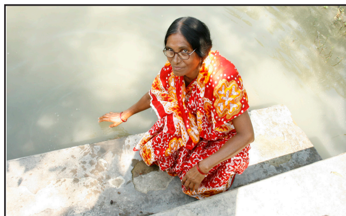
Microloan recipient and successful fish farmer shows her pond.

W omen in the developing world pay back their loans at a rate of 98% - an amazing response! In Bangladesh, where women generally have few rights, low literacy rates, and little education, micro-loans are proven to be life-changing to the women and to their families as their businesses grow, their knowledge increases, and they become more financially stable. Often, they are so successful that they are able to hire others in their village, thus serving as strong members of the community as well. Thanks for your part in changing the lives of over 3,000 families!