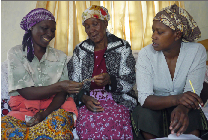
Kenya Microfinance Group