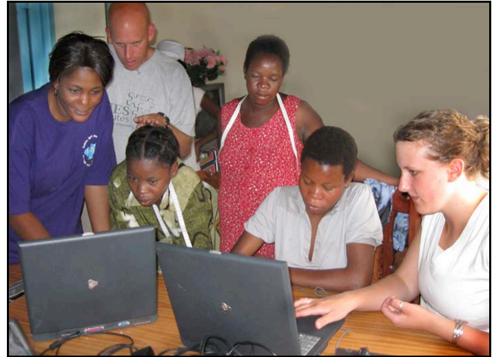
Refurbished laptops in Zambia, providing new opportunities