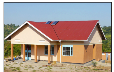
The completed maternity clinic.