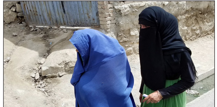
Afghanistan is known as the land of blue burqas.

TO INSPIRE WOMEN AROUND THE WORLD BY PROMOTING WELLNESS, EDUCATION, AND ECONOMIC OPPORTUNITIES