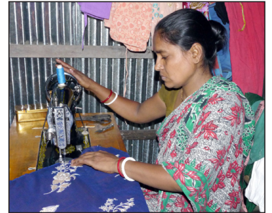
Woman in Sewing Training