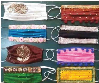
Face masks from the project

Without the generous support of donors just like you, this renewed opportunity would not be possible. Thank you for continuing to help inspire impoverished women around the world.