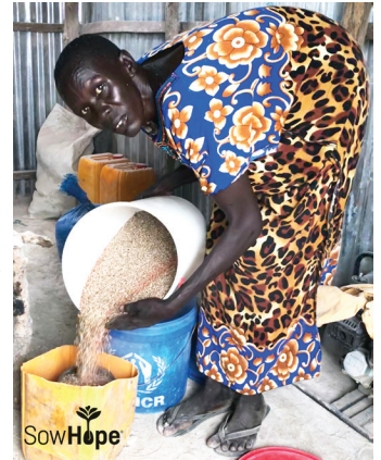
Selling grain in South Sudan

Your donations are more important than ever.