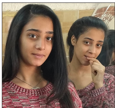
Young women in the hairdressing vocational class.

Another life-changing project created by Bassem's organization is a conference and vocational training center, situated on a 100-acre farm. Many women are able to take advantage of free vocational training in skills such as sewing and hairdressing. They find safety in this remote location while gaining expertise that empowers them, making them less vulnerable to kidnappings and human trafficking.