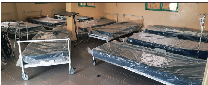
Hospital beds received in the shipment