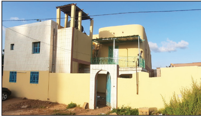
The finished two-story clinic