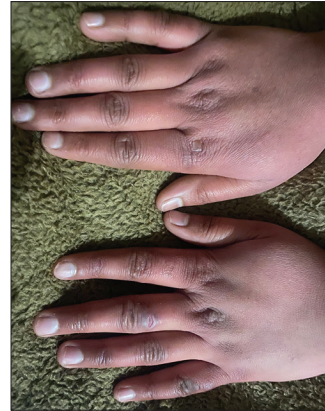
Hands of a student (used for privacy)