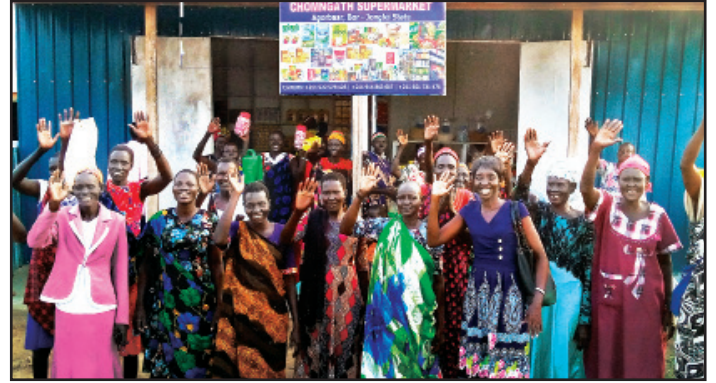
Local women's group at the new supermarket