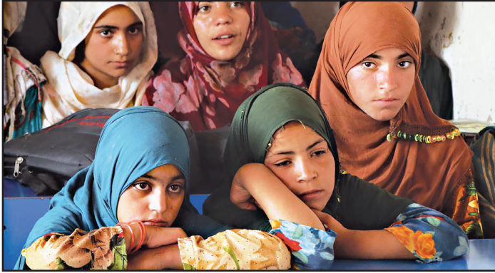
Opportunity for free learning