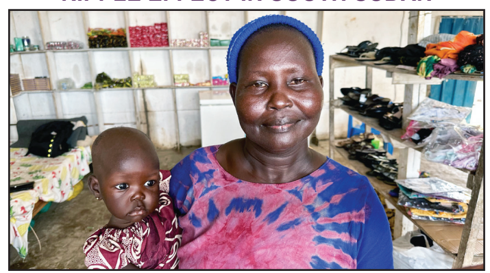
A shopper and her baby at the first local store

Earlier this year, a SowHope team visited South Sudan and witnessed the ripple effect of SowHope projects on our partner's work and the women they serve. In 2018, SowHope funded a project to build a grain grinding mill. This project allowed women to conserve time, generate income, and save money for future business endeavors. Many of the women in the community were able to use their savings to purchase farm land and produce excess crops, but the costs of traveling to the city severely impacted profits.